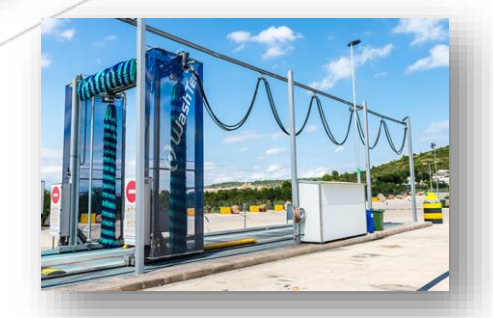
Lorry Washing Stations

We have an agreement with the company IPE for the supply of equipment manufactured by the most renowned names on the market.