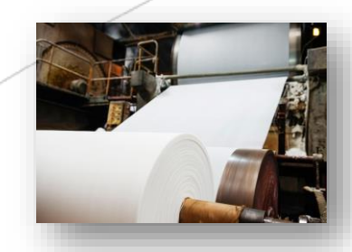
Pulp and Paper